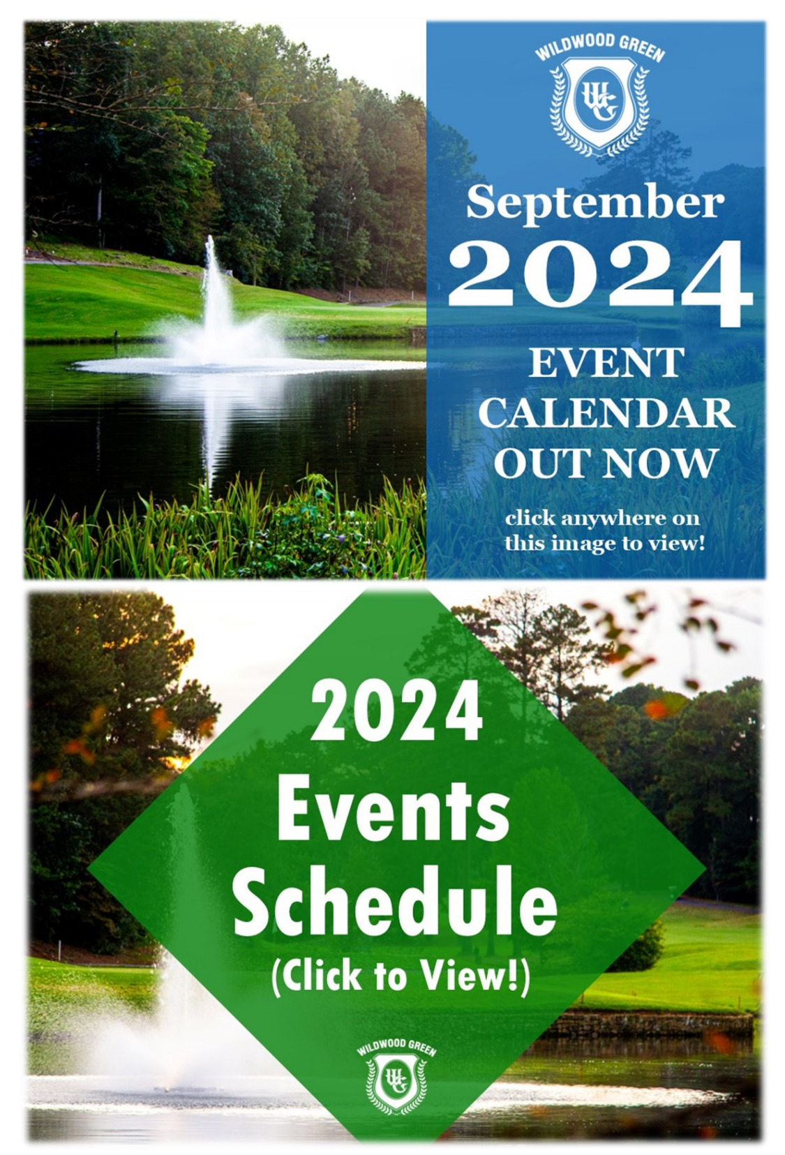
Go Here to View the 2024 Member Events Booklet

Go Here to View the September Monthly Events Calendar